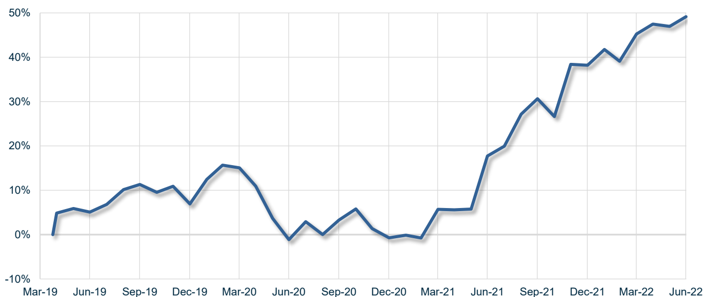
Figure 3: Trailing Period Net Returns to 30 June 2022 1, 2